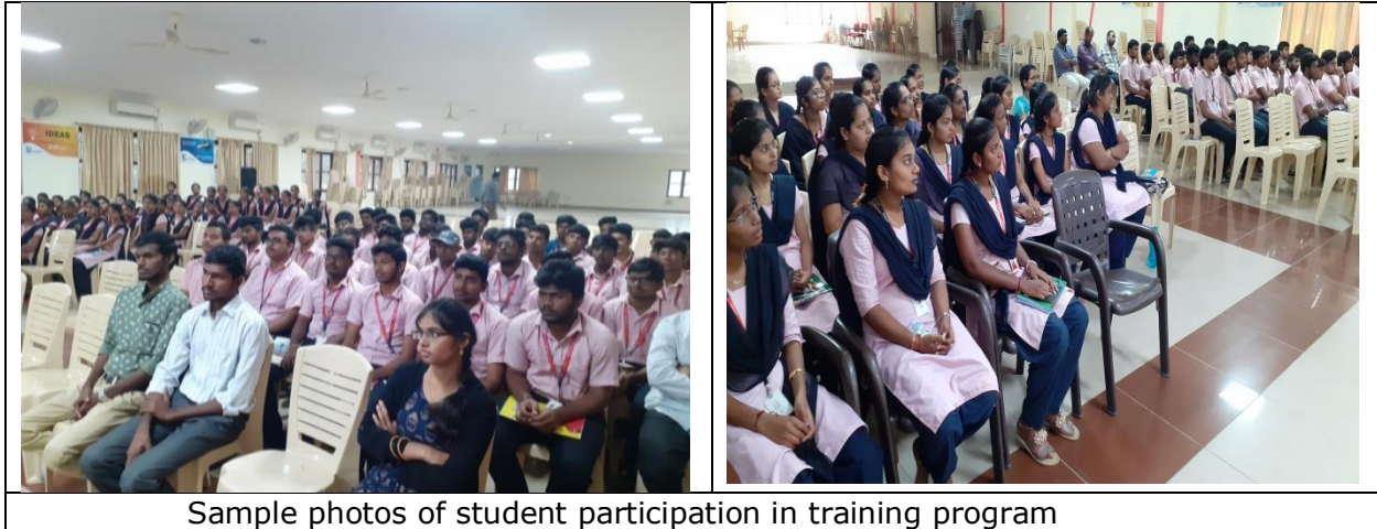
Sample photos of student participation in training program