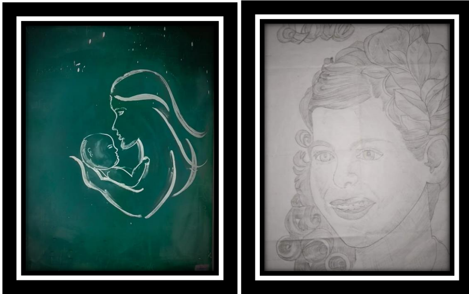
Art By K.Naresh III ECE